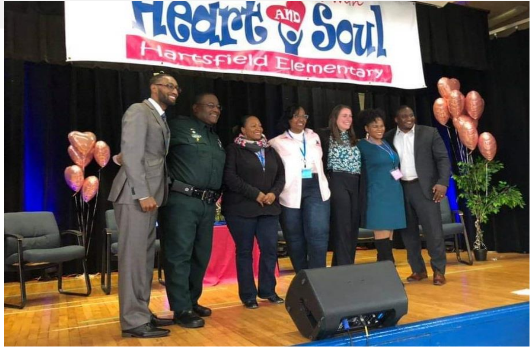
Panel Participants answer questions from parents at Hartsfield Elementary